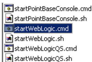
Figure 1 startWebLogic Script

Both of these start methods launch a command window and automatically begin the process to start the server. The server is running successfully when you see the RUNNING mode message in the command window.