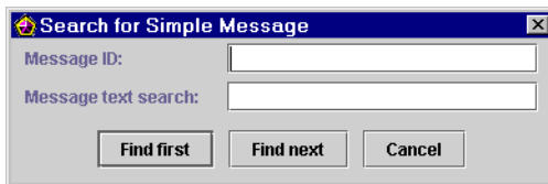
Figure 6-9 Search for Simple Message