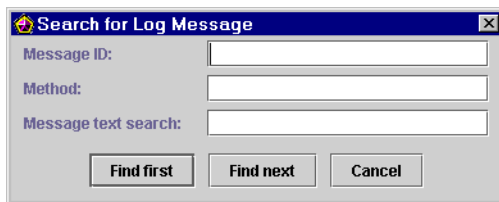
Figure 6-8 Search for Log Message